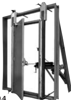
ANSI A 250.4