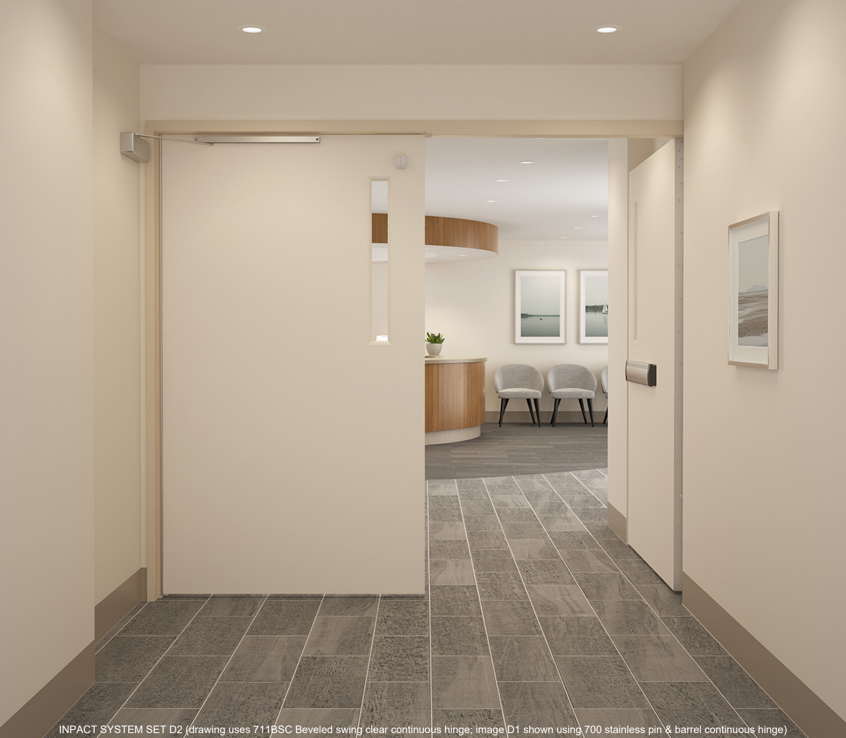
IMPACT SYSTEM SET D2 (drawing uses 711BSC Beveled swing clear continuous hinge; image D1 shown using 700 stainless pin & barrel continuous hinge)