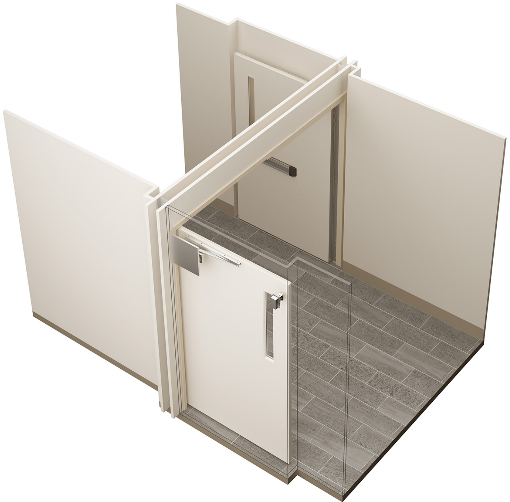
INPACT SYSTEM SET D2 (drawing uses 711BSC Beveled swing clear continuous hinge; image D1 shown using 700 stainless pin & barrel continuous hinge)