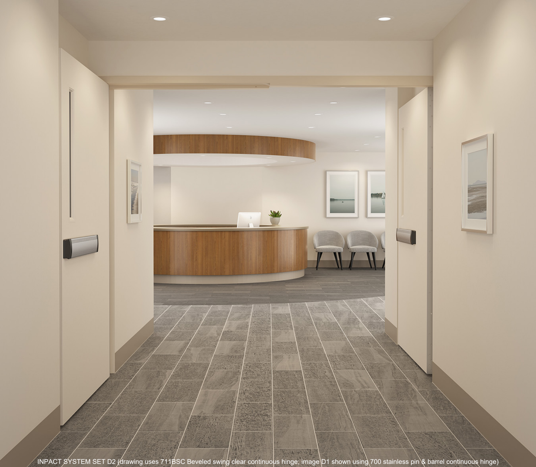
IMPACT SYSTEM SET D2 (drawing uses 711BSC Beveled swing clear continuous hinge; image D1 shown using 700 stainless pin & barrel continuous hinge)