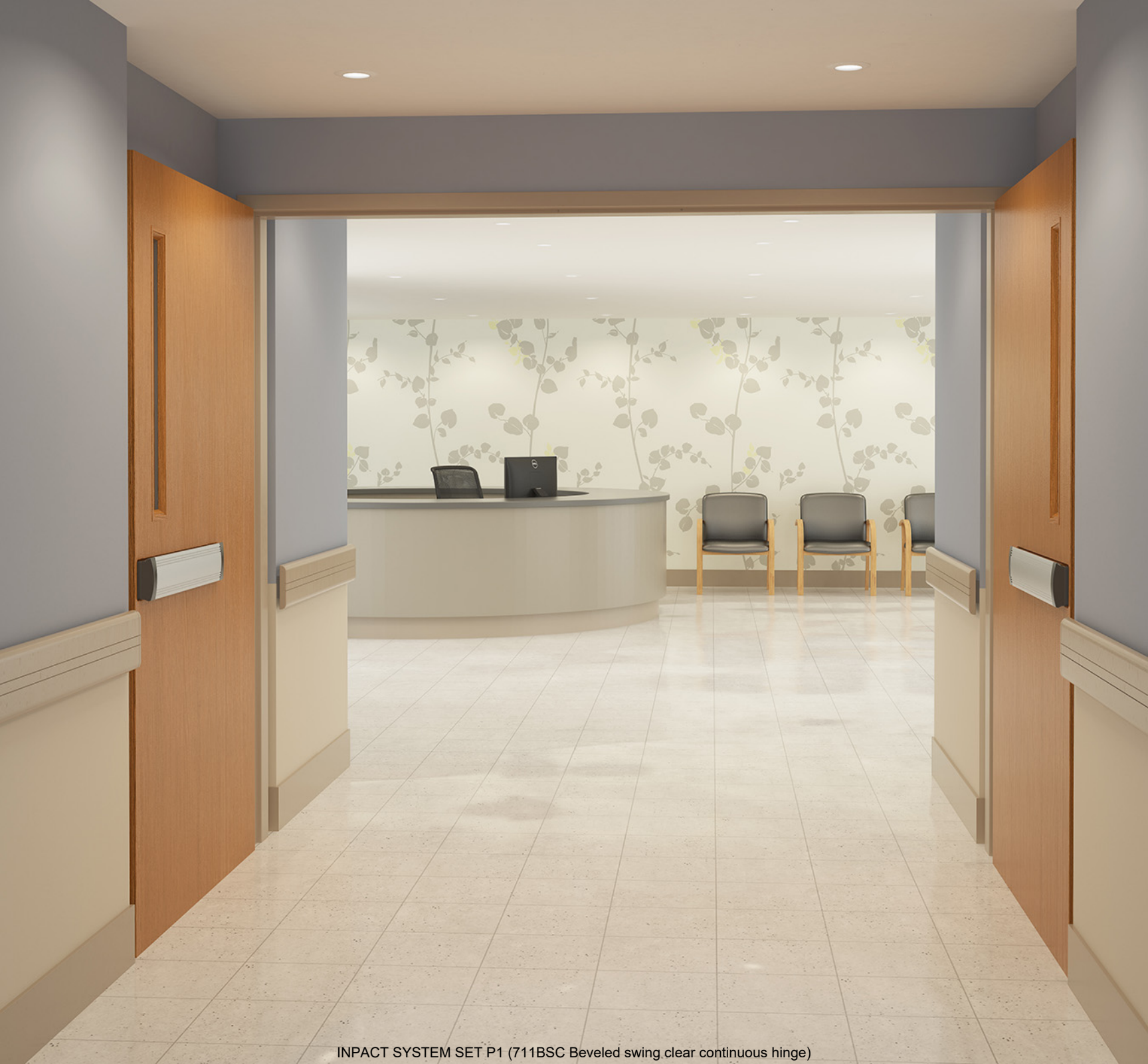
INPACT SYSTEM SET P1 (711BSC Beveled swing clear continuous hinge)