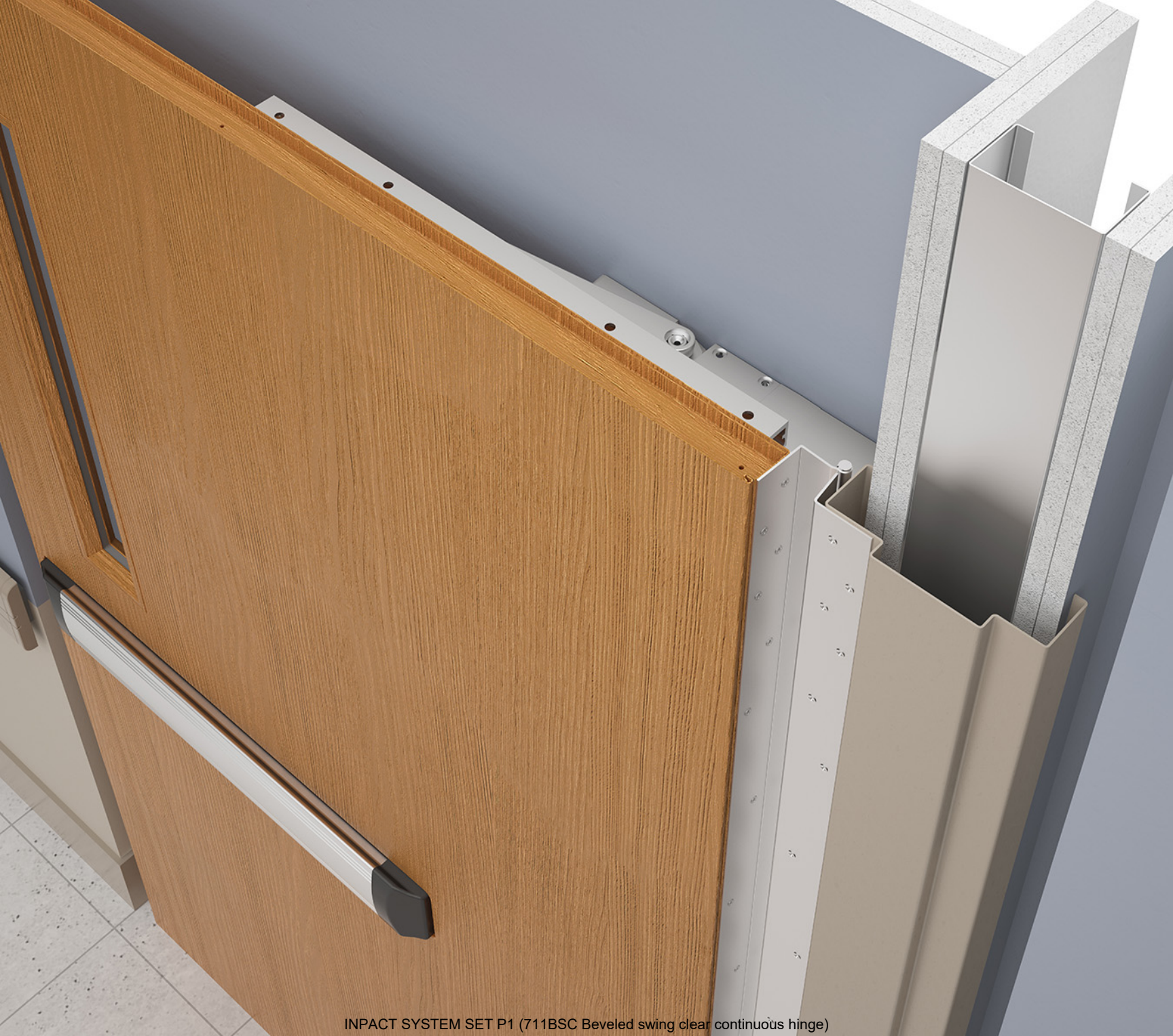
INPACT SYSTEM SET P1 (711BSC Beveled swing clear continuous hinge)