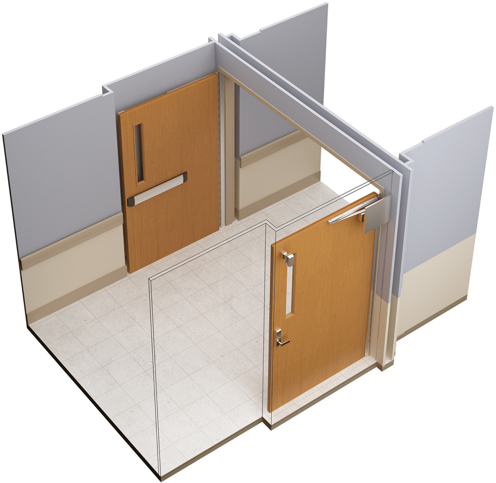
INPACT SYSTEM SET P1 (711BSC Beveled swing clear continuous hinge)