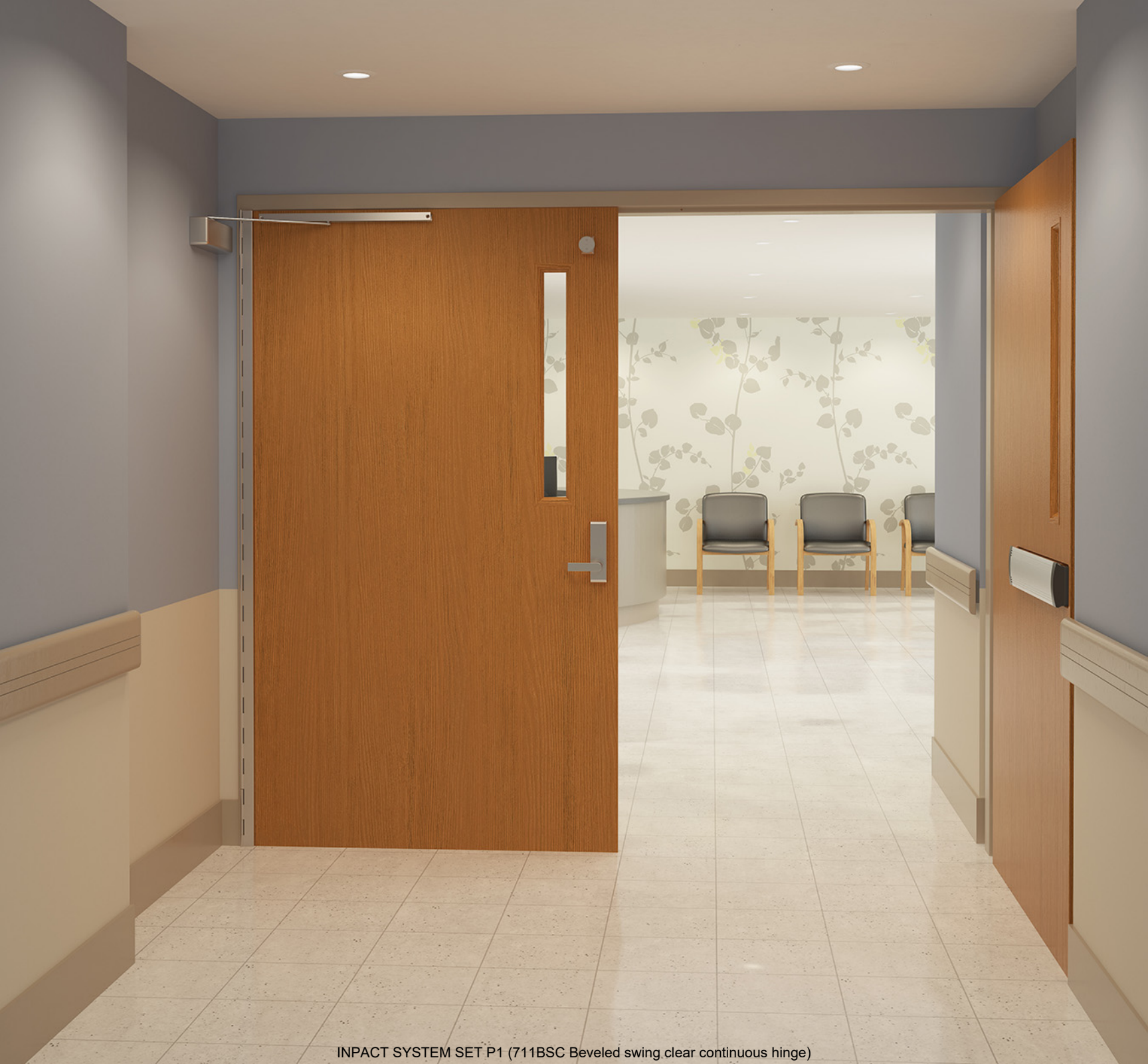
INPACT SYSTEM SET P1 (711BSC Beveled swing clear continuous hinge)