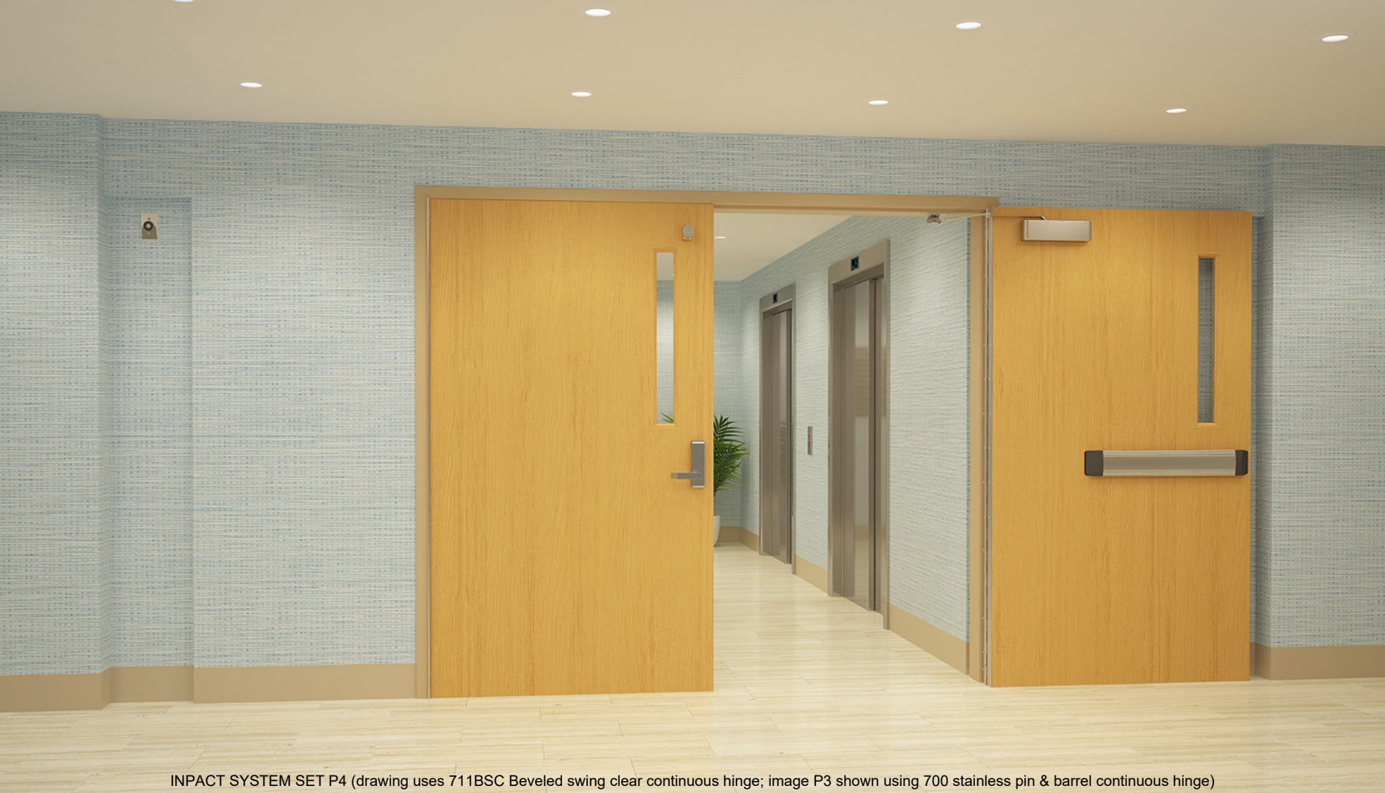
INPACT SYSTEM SET P4 (drawing uses 711BSC Beveled swing clear continuous hinge; image P3 shown using 700 stainless pin & barrel continuous hinge)