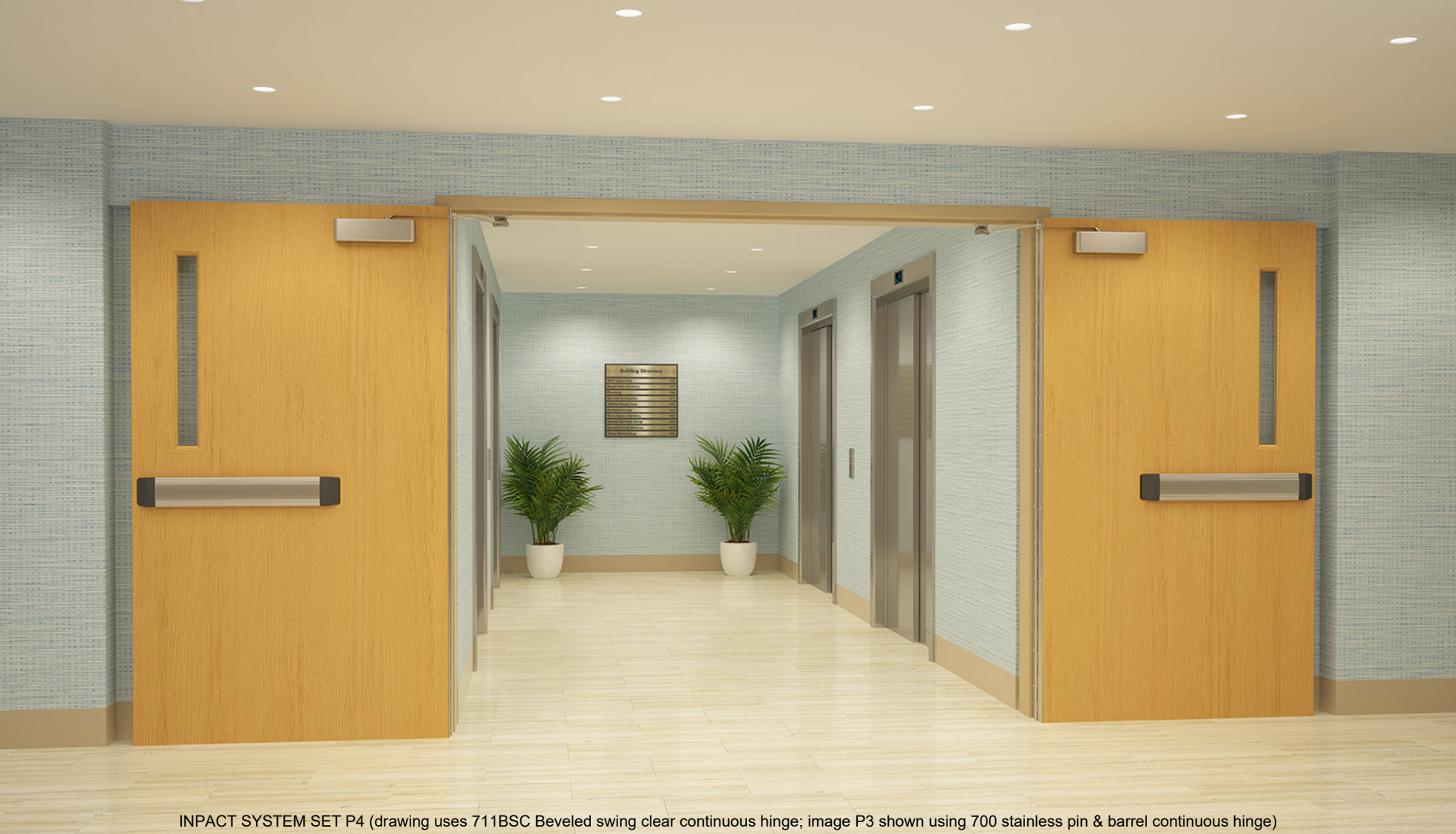
INPACT SYSTEM SET P4 (drawing uses 711BSC Beveled swing clear continuous hinge; image P3 shown using 700 stainless pin & barrel continuous hinge)