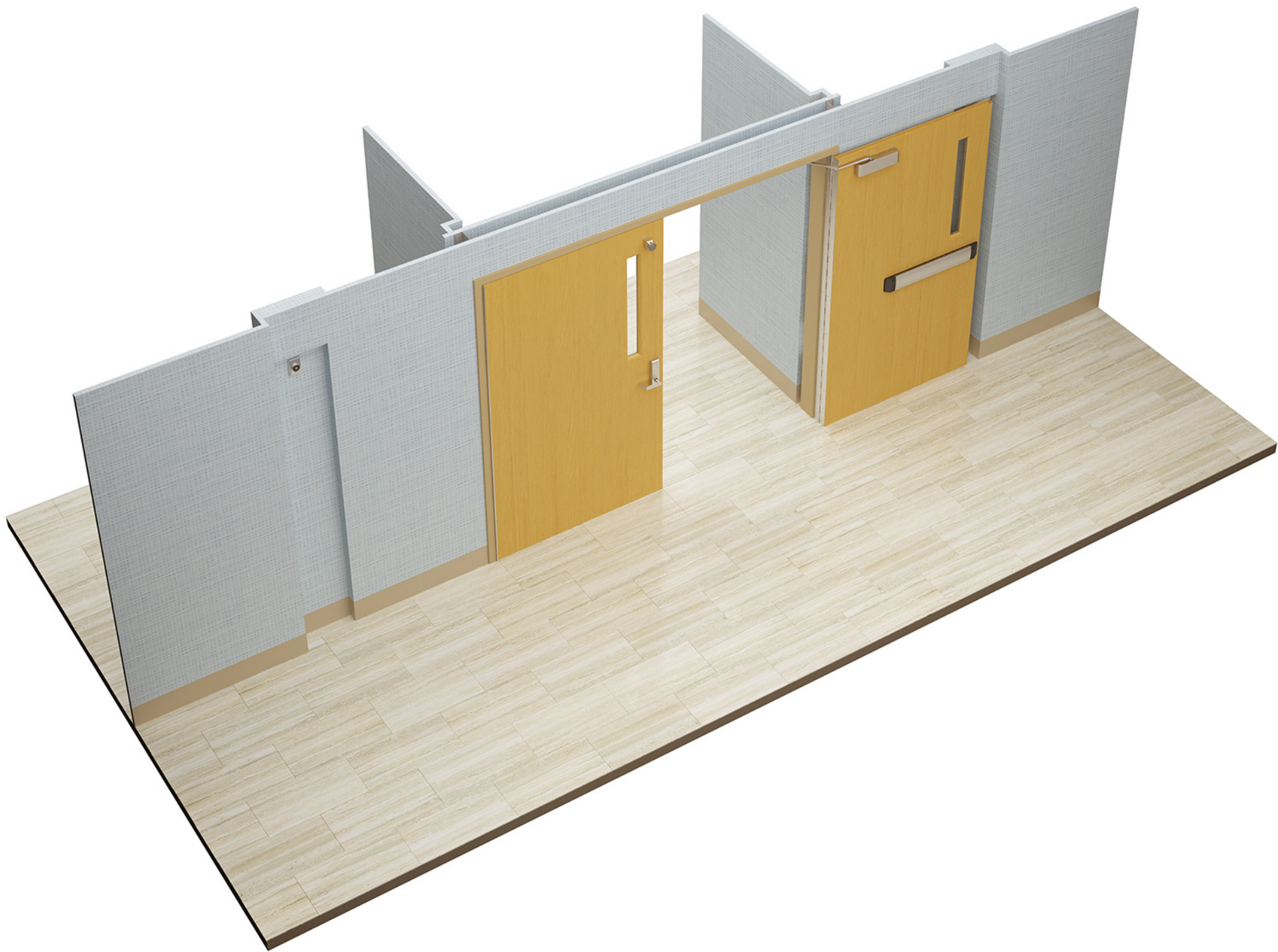
INPACT SYSTEM SET P4 (drawing uses 711BSC Beveled swing clear continuous hinge; image P3 shown using 700 stainless pin & barrel continuous hinge)